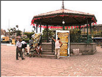
The main Zocalo is great for people watching

Fortunately, the 50,000 residents of San Blas and its vicinity had been evacuated to shelters in upland Tepic. After the storm, the Mexican Army arrived to prevent looting and to operate the heavy equipment that reopened the roads and got basic power and water back online.