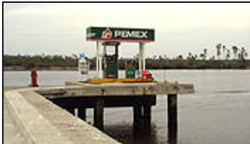
Until the special discount is removed, San Blas fuel dock has one of the cheapest diesel prices on Pacific Mexico

Second, the price of diesel and gasoline in San Blas is reported among the lowest along Pacific Mexico, because there’s no “pipa” or tie-up fee – at least for now. This benefit won’t last forever; it’s intended to help the community of San Blas get back on its feet economically after Hurricane Kenna’s devastating blow.