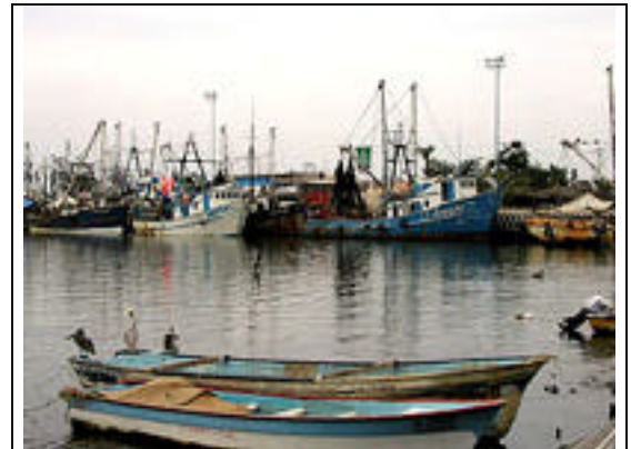
San Blas' main harbor has lots of room for the local shrimper fleet, here tied several hulls deep in the first basin, before you reach the fuel dock. Note the Pemex sign in the background