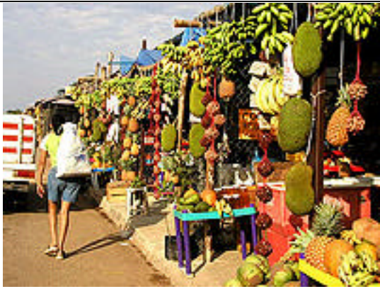
San Blas is a good place to reprovision for wonderful fruits & veggies not readily found on Baja

Until a few years ago, Goldie acted as San Blas' unofficial ship's agent by